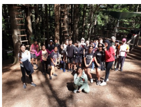
Year 10 students at TreeTops Adventure Park—The Hills

Year 10 have had a busy start to the 2021 school year. They have almost completed the first semester of the year and students have continued to experience success inside the classroom as well in the sporting carnivals.