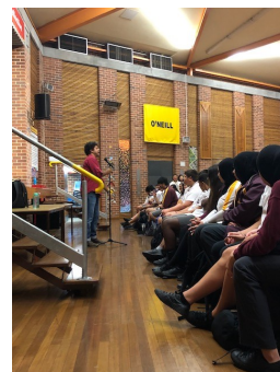
Year 9 & 10 students 'Slam Poetry'