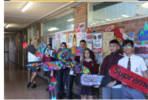
Centre: Year 8 students with completed skate deck designs.