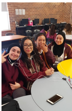
Year 11 students attending the ABCN Focus Leadership digital workshop.