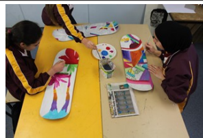
Top: Year 8 students working on their skate decks.