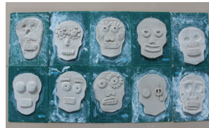
Bottom: Year 9 Elective Visual Arts 'sugar skulls' ceramic work in progress.