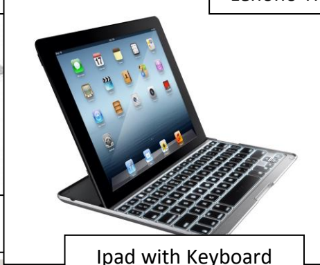
Ipad with Keyboard