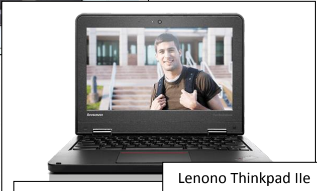
Lenono Thinkpad I1e